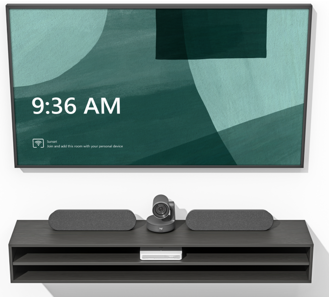
Logitech RoomMate shown with Rally Plus system