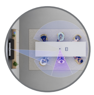
Capture the Action