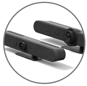
Requires Rally Bar & Rally Bar Mini